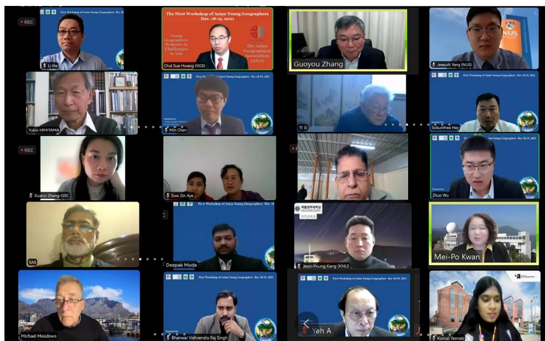
The First Asian Young Geographers Workshop (virtual)

On December 18 th -19 th , 2021, the First Asian Young Geographers Workshop was held online. Initiated by the Young Geographers Working Group of the Asian Geographical Association (AGA-YGWG), the Workshop was jointly organized by AGA-YGWG, Young and Early Career Geographers Task Force of the International Geographical Union (IGU-YECG) and Working Committee for Young Geographers of the Geographical Society of China (GSC-WCYG). Under the theme “Young Geographers’ Response to Challenges in Asia”, the workshop attracted about 600 participants from 30 countries and regions worldwide. After call for paper within two weeks, a total of 213 abstracts and papers were received. As a result, 178 of them have been selected for oral presentations in 14 sessions of different topics, such as Building Resilience to Poverty Reduction in Asia, Hydro-Climatic Extreme Events in Mountain Regions, Geographical Indications Environment and Sustainability, etc.