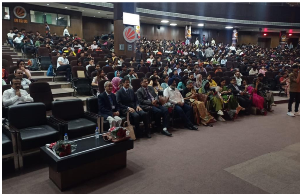
Assembling of the participants at Shanti Devi Memorial Auditorium