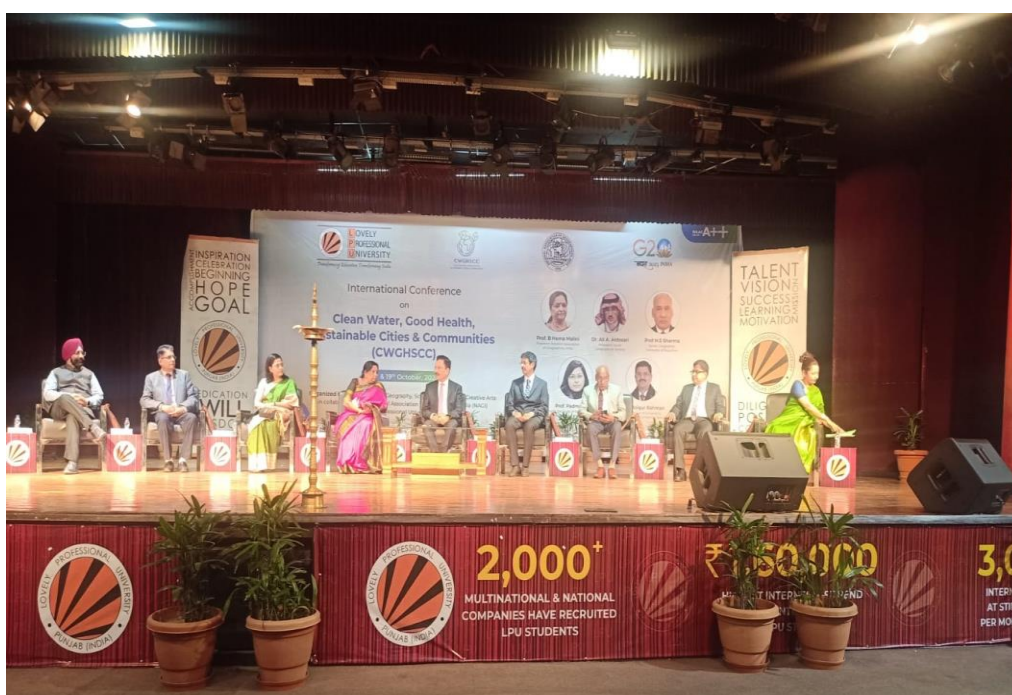
Dignitaries on the dais for Inaugural Ceremony